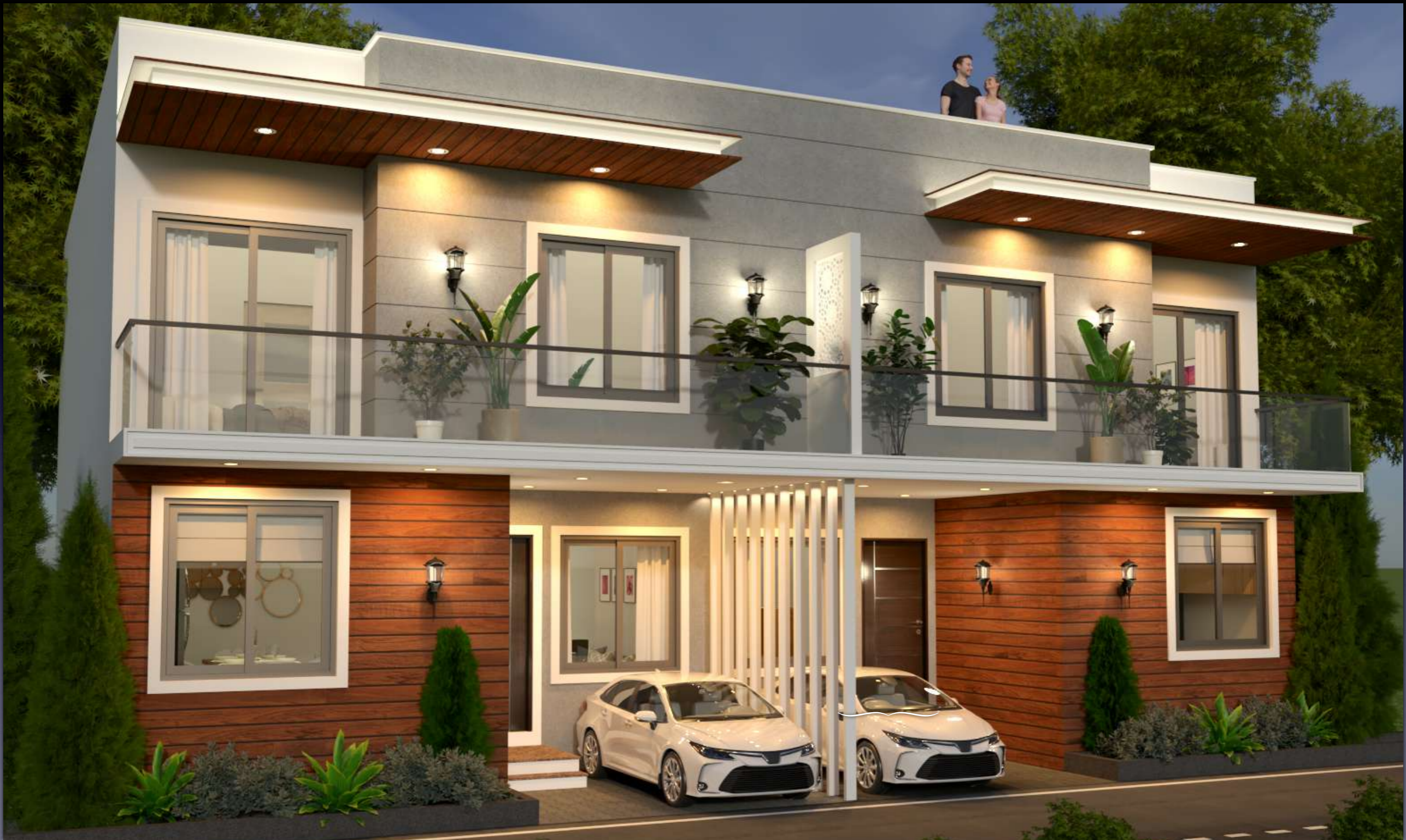
3D VIEW EXTERNAL