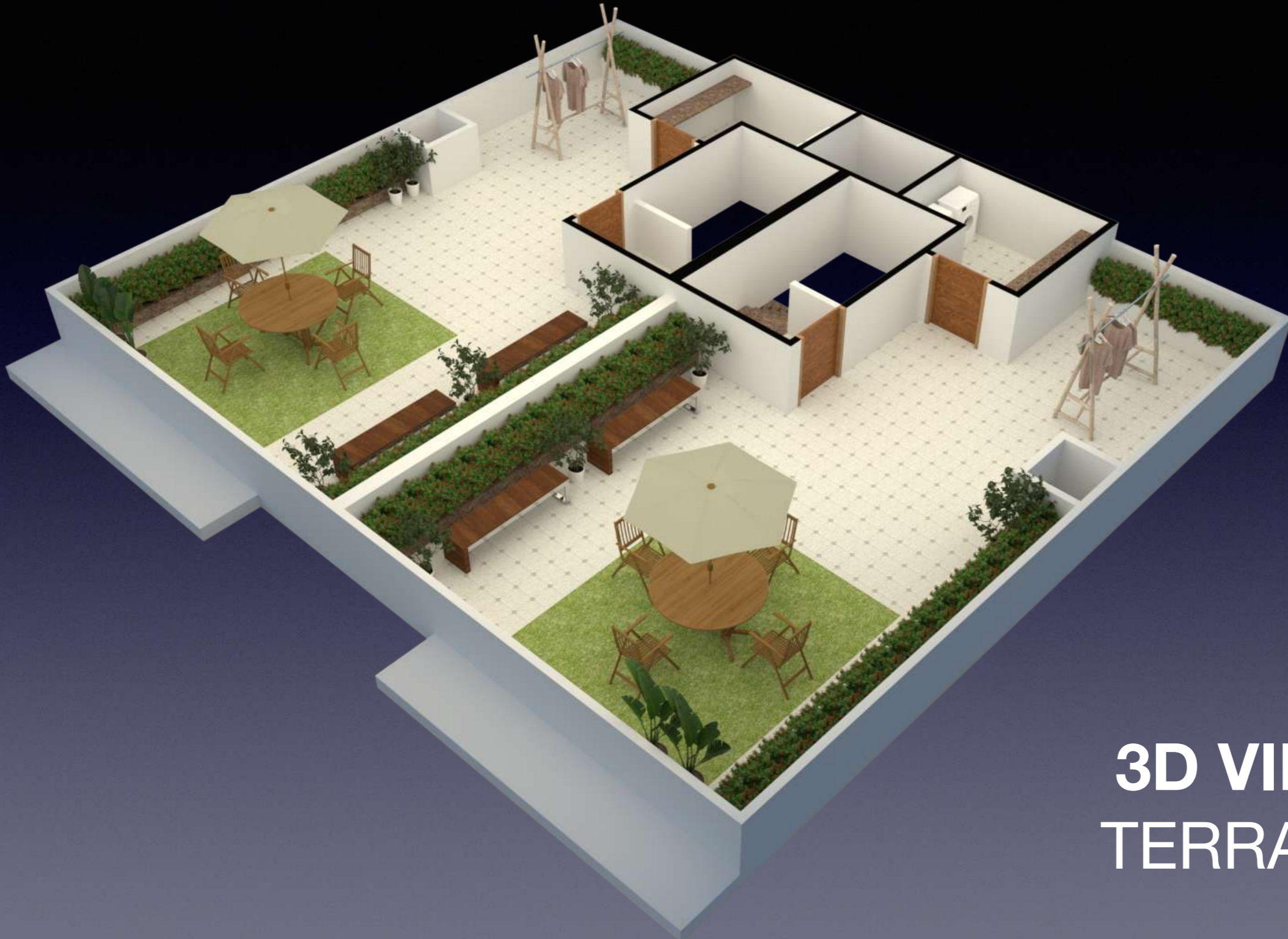
3D VIEW TERRACE