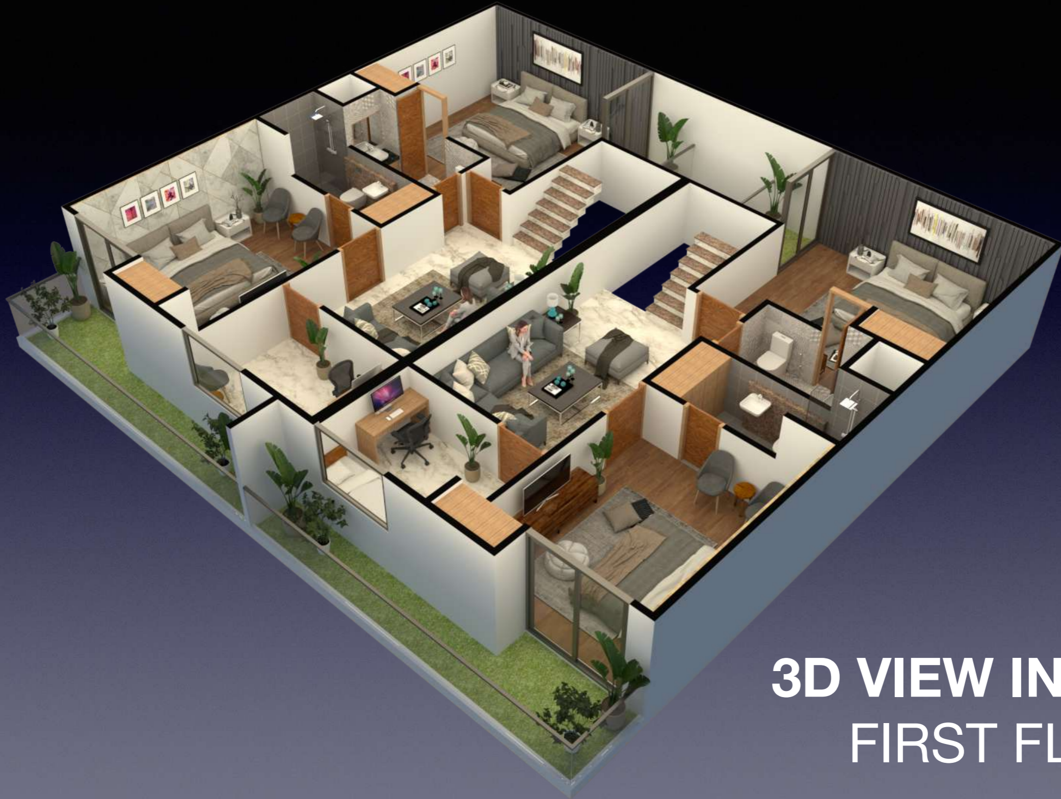
3D VIEW INTERIOR FIRST FLOOR